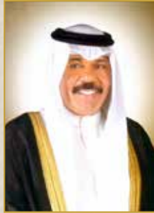
His Highness Sheikh Nawaf AL-Ahmad AL-Jaber - AL-Sabah The Crown Prince God save Him