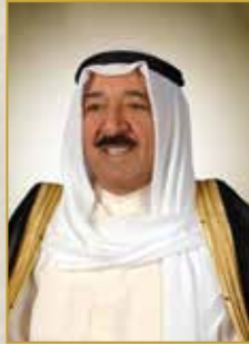
His Highness Sheikh Sabah Al-Ahmad Al-Jaber Al-Sabah Amir of the State of Kuwait God Save him and Protect him