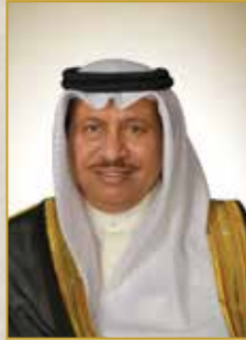
His Highness Sheikh Jaber Al-Mubarak Al-Hamad Al-Sabah Prime Minister God save Him